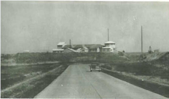
- The Shop - 1957

The Editor thought he would add some to "BTTF" as well. Where do you think they were taken? Email me.