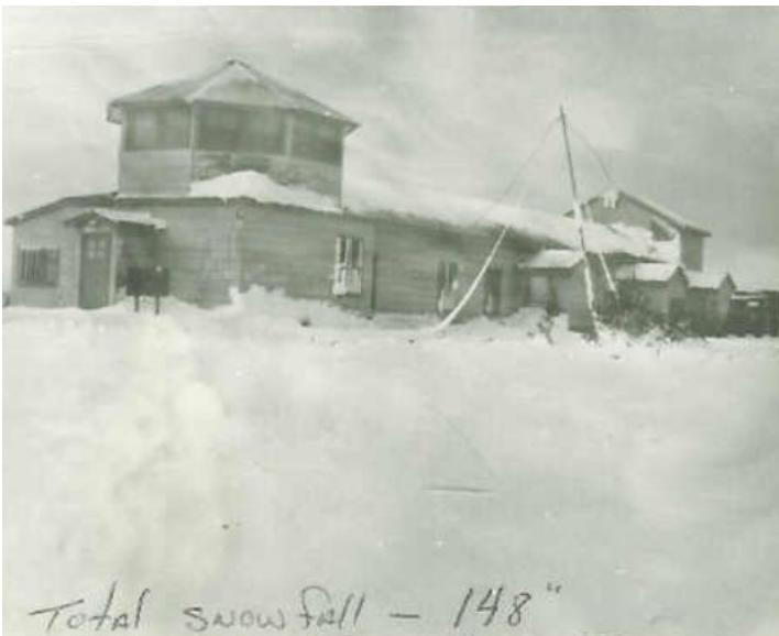
Total snowfall - 148" 12 FEB 58

Answers to the photo quiz next time along with a few more.